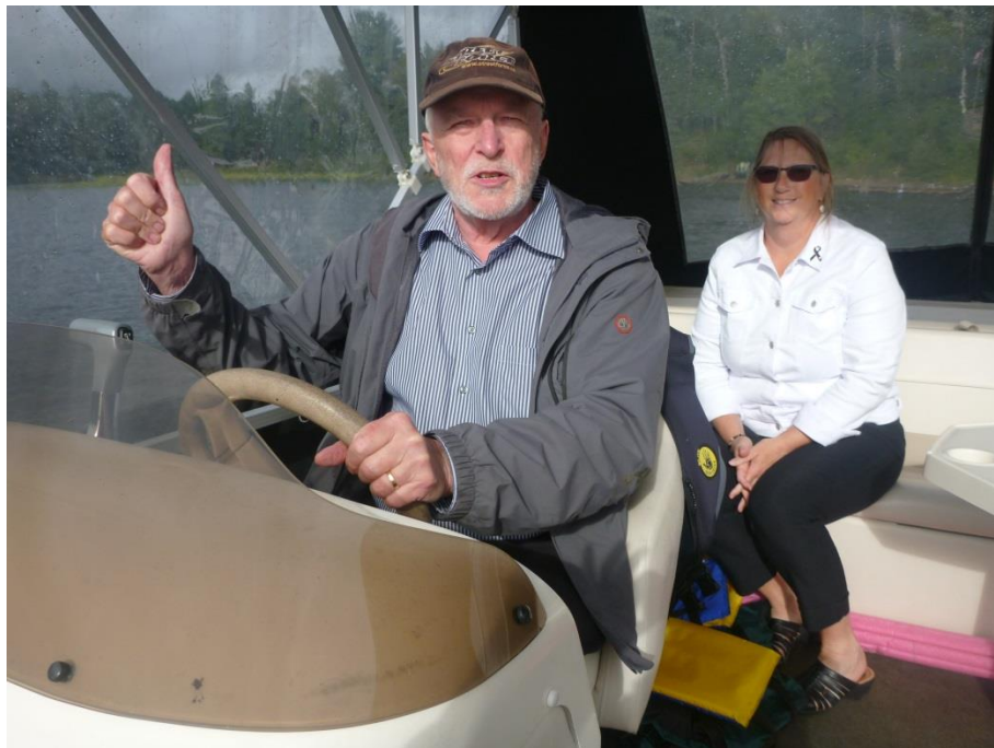
Oxtongue Lake pontoon tour