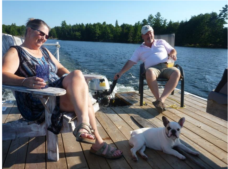
Walker Lake motorized dock tour